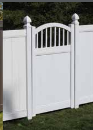
Chesterfield Smooth Finish Convex Gate with Victorian Accent in White