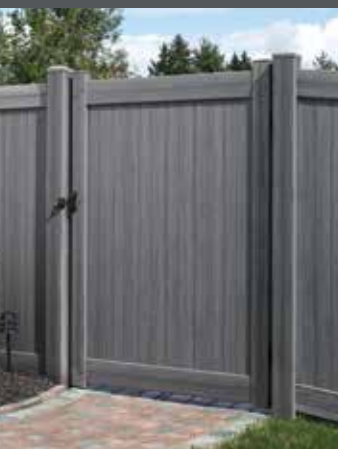
Chesterfield CertaGrain Texture in Arctic Blend