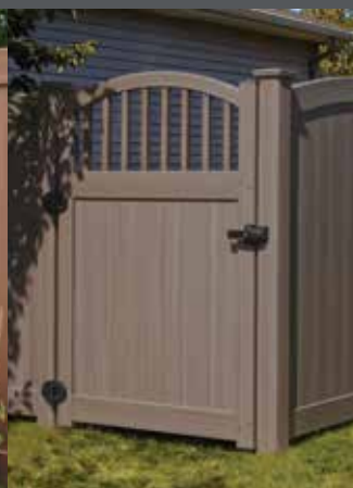
Chesterfield CertaGrain Texture Convex Gate with Victorian Accent in Weathered Blend