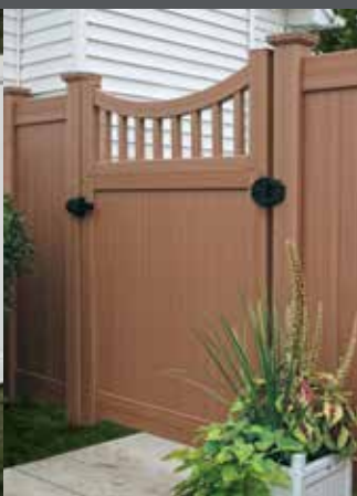
Chesterfield CertaGrain Texture Concave Gate with Victorian Accent in Sierra Blend