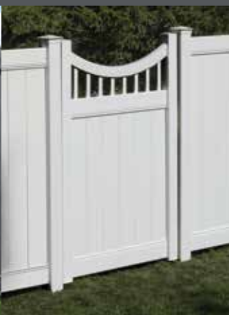
Chesterfield Smooth Finish Concave Gate with Victorian Accent in White